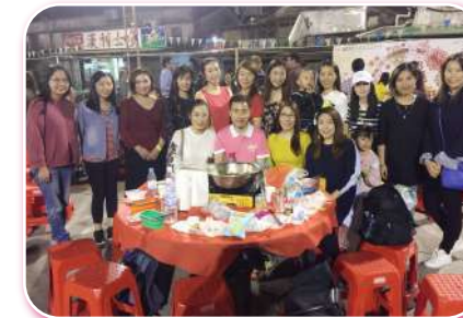
JCI Yuen Long Poon Choi Dinner and Day Tour