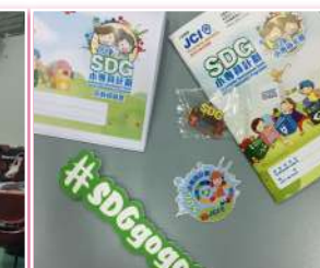
Girl Guides and Leaders are recognized with a special badge or pin upon successful completion of SDG Junior Ambassador Programme.

In early July, there will be an exchange opportunity for selected Outstanding SDG Junior Ambassadors (Hong Kong Girl Guides) to Tokyo, Japan. We are pleased to have confirmed Hong Kong Airlines as Airline Sponsor to provide this valuable opportunity to our young girls. Our aim is to provide a chance for the young Girl Guides to represent Hong Kong to present what they have done in Hong Kong related to the SDGs and how they impact their local communities, and they will be given a chance to explore how SDGs are promoted and implemented in Japan. In addition, we will conduct our training in Japan with the Girl Scouts of Japan to share views on international issues and to extend our global reach in our Programme. More trainings abroad and events will be announced in the coming month including a special social media video campaign, stay tuned on our Facebook www.facebook.com/sdgja for the latest information.