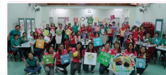
The participants were highly motivated and engaged by the trainers through activities and games! Throughout the training, they were able to understand more about the Sustainable Development Goals. Feedback from participants said: “The training was fun and useful in designing and planning their activities in the future to promote SDGs to our kids and our community”.

We are excited to present you the first-ever “Train-the-Trainers” Workshop co-organized with Hong Kong Girl Guides Association. It was successfully held on 6 May 2018 with over 50 participants including Guiders, Rangers and our Jayceette members!