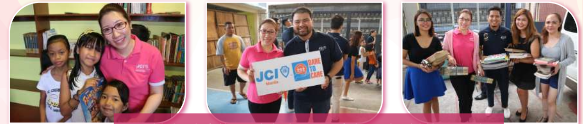
Visited the launch of a library in the local community for less privileged children in Manila