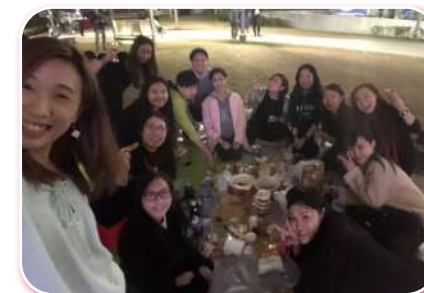
Best of British: Picnic with the Jayceettes