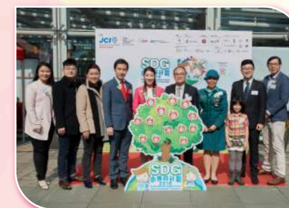
Many honorable guests attended and officiated the Kick-off Ceremony