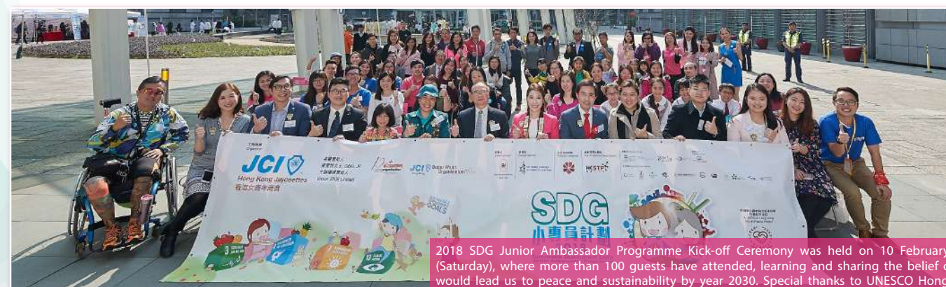
2018 SDG Junior Ambassador Programme Kick-off Ceremony was held on 10 February 2018 (Saturday), where more than 100 guests have attended, learning and sharing the belief of SDG would lead us to peace and sustainability by year 2030. Special thanks to UNESCO Hong Kong Association - Peacemakers' Celebration and Hong Kong Science Park for sponsoring the venue for this debut event. As well, we are happy that our SDG Junior Ambassador Programme is recognized as one of the “Social Peace Project” by our Strategic Partner UNESCO Hong Kong Association