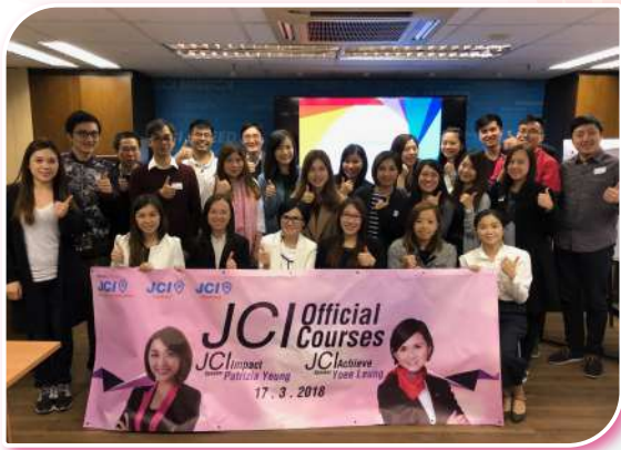
Co-organized by JCI Hong Kong Jayceettes, JCI Harbour and JCI Bauhinia, the JCI Official Courses – JCI Impact and JCI Achieve were successfully held on 17 Mar 2018 with over 50 participants from 8 different chapters, to equip our participants to be the future JCI trainers!