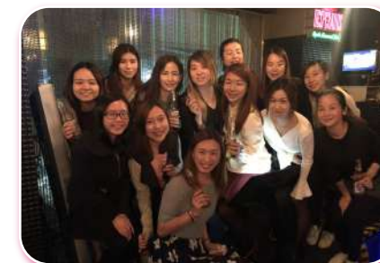
Joint 8-Chapter Happy Hour