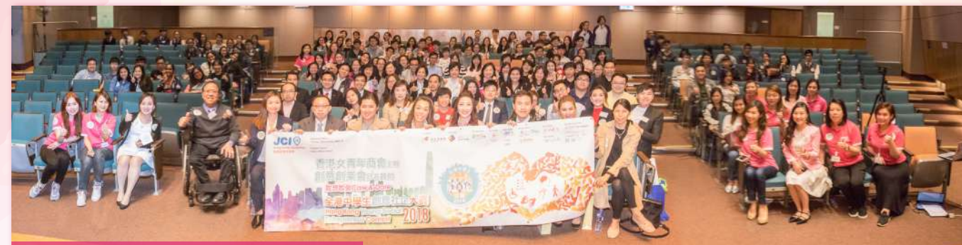
Group Photo of Participating Students, Teachers and Guests

Over 150 participants were equipped with knowledge on the disabled population of Hong Kong through interactive panel sessions and discussions. Students also learnt about the Social Enterprise Business Model and the techniques in writing business proposals.