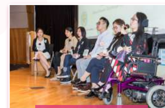
Panel Discussion Session