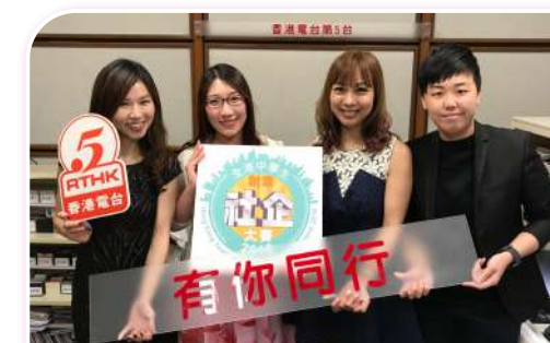
One-hour Radio Interview to Raise Awareness on "Social Inclusion" & "Care for Disabled"

We were honored to have received RTHK's invitation to introduce HKYSEC and promote "Care for Disabled" to Hong Kong citizens.