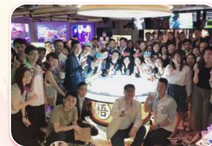
Joint 7-Chapter Happy Hour