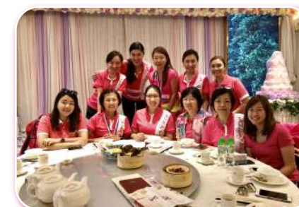
Casual Lunch during JC Sports Day