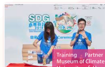
Training Partner Jockey Club Museum of Climate Change, Chinese University of Hong Kong has also organized an Eco-Enzyme Workshop by giving the audiences some tips on creating a green lifestyle